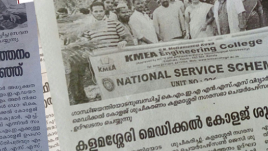
ഗവ. മെഡിക്കൽ കോളേജിൽ എൻ.എസ്.എസ്. സേവനം നടത്തിയ വിദ്യാർത്ഥികൾ.