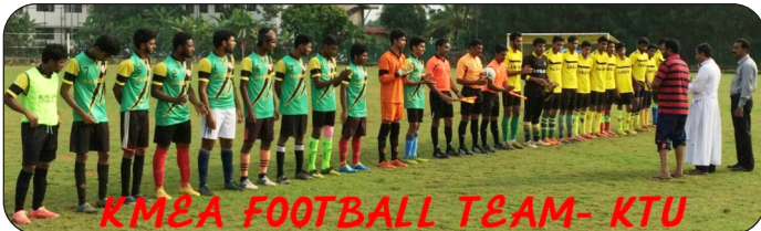
Abdul Kalam KTU Intercollegiate Football tournament held at Rajagiri School of Engineering and Technology on 4th November 2016