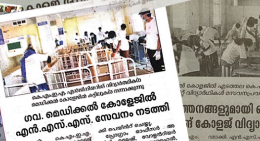
കെ.എം.ഇ.എ എൻജിനീയറിംഗ് വിദ്യാർത്ഥികൾ മെഡിക്കൽ കോളേജിൽ കഴിയുന്ന പ്രവൃത്തി.