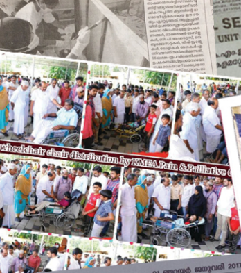
2016 ജൂലൈ 20