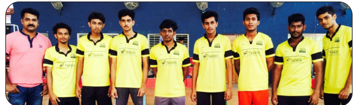
College Team participated in the APJ Abdul Kalam KTU D Zone (Ernakulam) Intercollegiate Volleyball tournament held at MA College, Kothamangalam on 4th November 2016