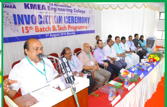
Inaugural Address by Jb. V.K. Ebrahim Kunju MLA