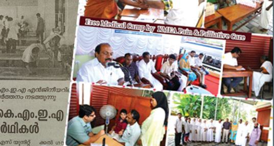
Free Medical Camp by KMEA, Pain & Palliative Care.