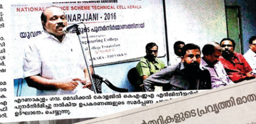
എറണാകുളം ഗവ. മെഡിക്കൽ കോളേജിൽ കെ.എം.ഇ.എ എൻജിനീയറിംഗ് വിദ്യാർത്ഥികൾ ഉപകരണങ്ങൾ നന്നാക്കി നൽകി.

നാനുഭാവം ഉപകരണങ്ങൾ മറ്റുനൂറുകൾ നന്നാക്കി നൽകി കളഭംഗം • എറണാകുളം ഗവ. മെഡിക്കൽ കോളേജിലെ 120 കിഴി ഉപകരണങ്ങൾ നന്നാക്കി നൽകി. എൻജിനീയറിങ് വിദ്യാർത്ഥികൾ മെഡിക്കൽ കോളേജിലെ ഉപകരണങ്ങൾ നന്നാക്കി നൽകി. എൻജിനീയറിങ് വിദ്യാർത്ഥികൾ മെഡിക്കൽ കോളേജിലെ ഉപകരണങ്ങൾ നന്നാക്കി നൽകി.